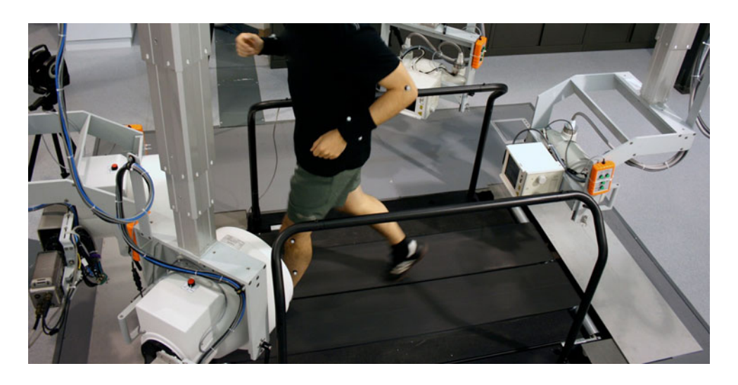
Fig. 4 DSX

et al. [60] using high-speed biplane fluoroscopy when monitoring knee kinematics during landing from a height of 40 cm. The authors validated the system by dropping 3 cadaveric knee specimens with implanted tantalum beads from a height of 40 cm and then comparing the positions of beads and bones, respectively.