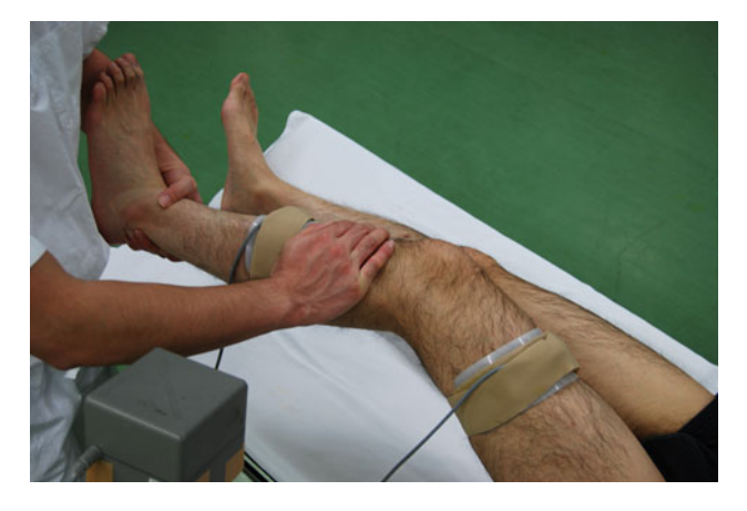
Fig. 3 Electromagnetic tracking device

Radiostereometric analysis (RSA) has been used with a superb accuracy to monitor three-dimensional knee motion not only during A-P laxity testing [24, 34] but also during functional movements ("dynamic RSA") such as active knee extension [14, 32], running [78, 79] and jumping [21]. The procedure involves insertion of multiple (typically 5–10) tantalum markers with the diameter of 0.8–1.6 mm in the femur and tibia. Imaging is done by means of biplane